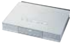
PCSA-DSB1S Data Solution Box