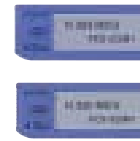
PCS-323M1 H.323 MCU Software PCS-320M1 H.320 MCU Software